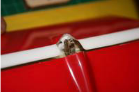
Control rod installed