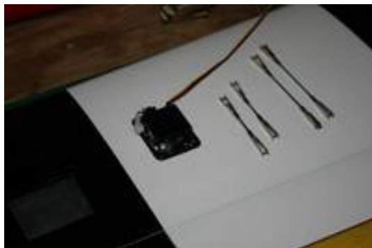
Control horns for ailerons and flaps